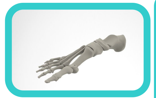
6. The screw head should preferably be flush with the bone surface