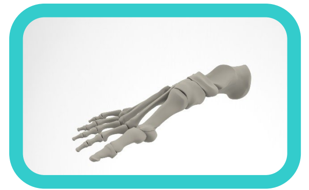
1. Preparation of the osteotomy with standard operation techniques. Minimally invasive incisions are possible