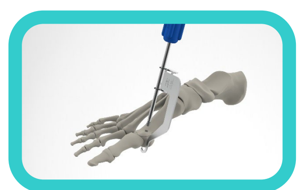
5. Removal of the broken off shaft. If necessary, retighten the screw through the drive within the screw head