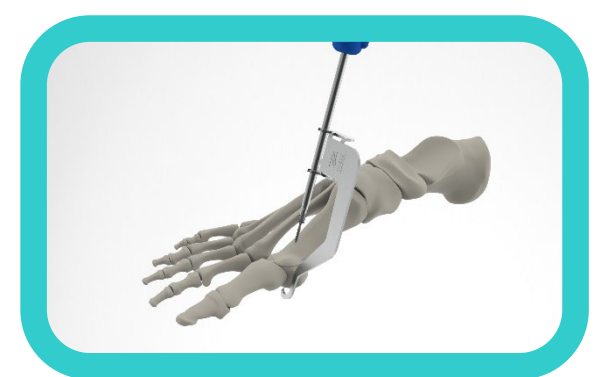
3. Positioning of the screw on the screw driver followed by the insertion of the former during which the navigator can be used as a counter torque wrench. Alternatively use C04 005 to applicate the screw with a surgical machine